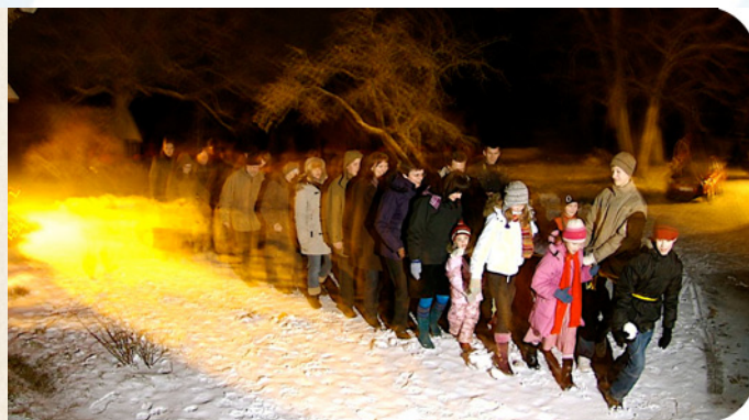
Dragging of the Christmas log at Austris Grasis house „Ģenderti” near Mazsalaca, 2008.