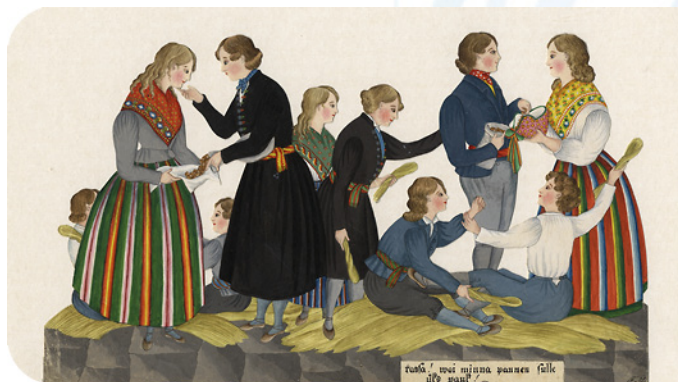
Painting of F.v. Uexküll (early 19th century), from the archives of the Estonian National Museum

From Estonian Ministry of Foreign Affairs, www.vm.ee